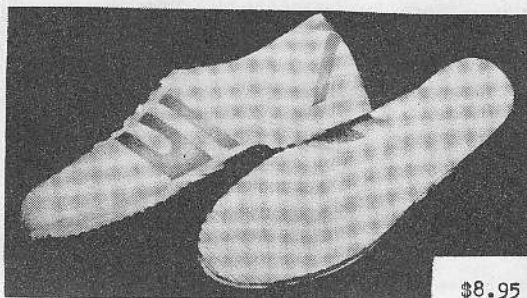
"TG-4 MARATHON SHOE"